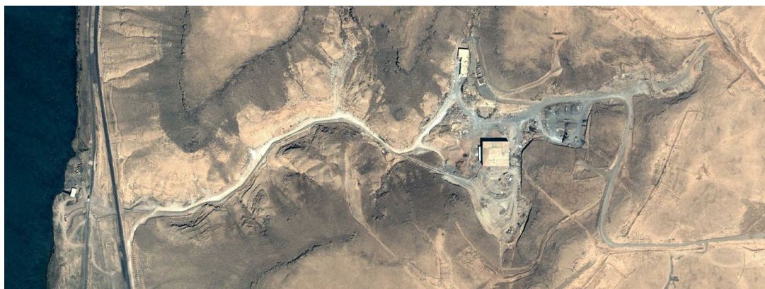
The Al Kibar site (35.708 N, 39.833 E) in Syria in August 2007, shortly before it was destroyed by Israeli aircraft. The construction of an undeclared plutonium production reactor had apparently been underway, 40 possibly with foreign assistance.